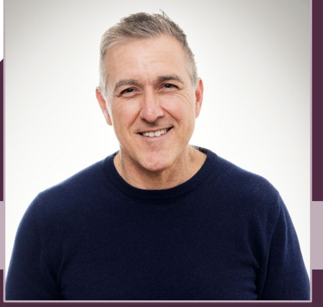
INTERIM CHIEF OPERATIONS OFFICER