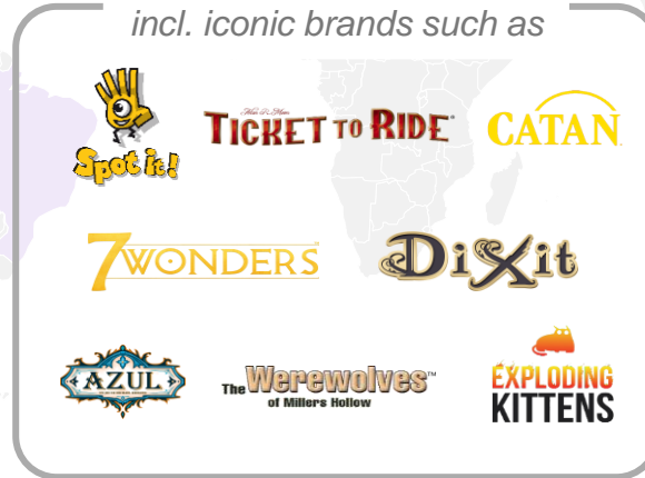
Dozens of IPs acquired incl. iconic brands such as