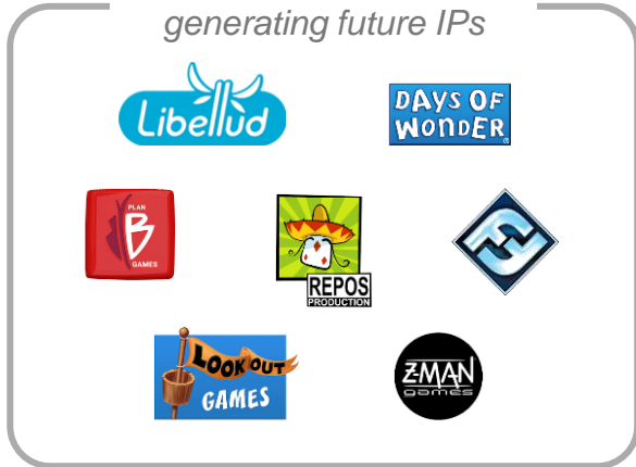
Select studio acquisitions generating future IPs